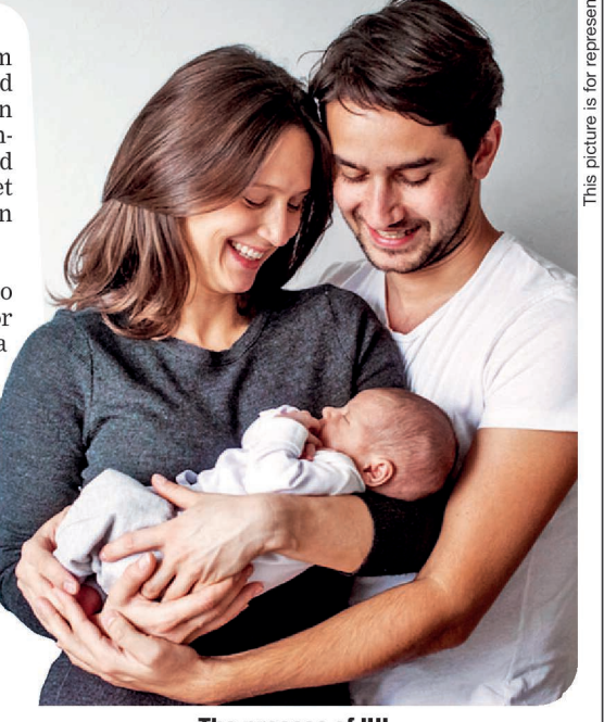
This picture is for representational purposes only.